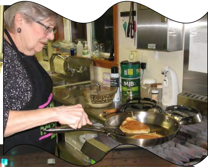
Shrove Tuesday Pancake Supper & Worship At Smyrna UCC, March 5