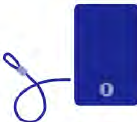
Pistol key vault

Fill out our form at bit.ly/ClackCoSaferHome (or scan the QR code) to indicate the type and quantity of item(s) you are requesting and arrange for pickup at our Oregon City office. If you are unable to pick up, please let us know and we may be able to arrange for delivery.