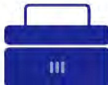
Medication lock box