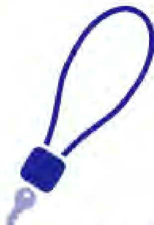
Cable gun lock