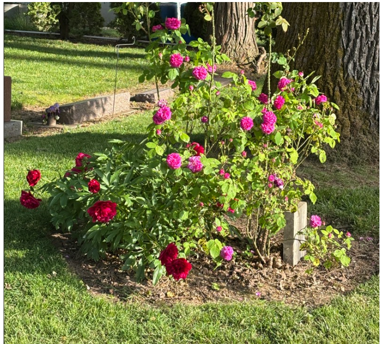
Peony & Calico Rose planted over 100 years ago

31119 S Hwy 170 Canby, Oregon 97013 www.smyrna-ucc.org