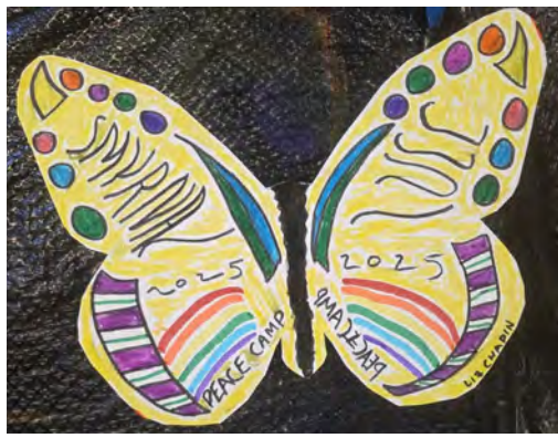
Butterfly Song By Liz Chapin & Peace Campers 2025 Sung to the tune of I've been working on the railroad